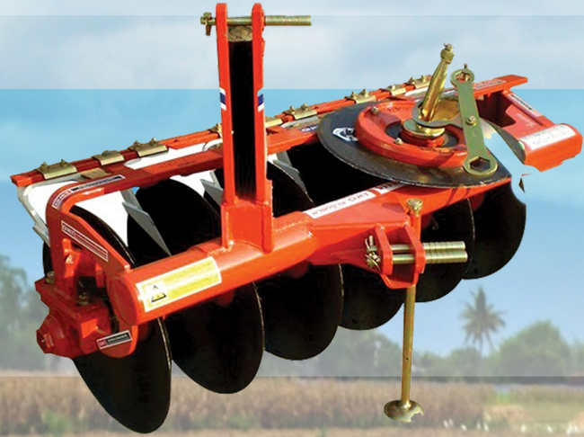
Poly Disc Plough